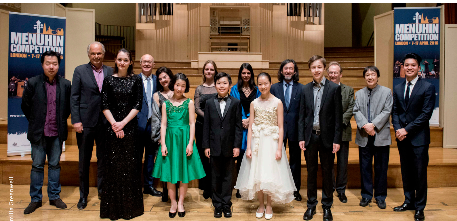
The London 2016 jury with the Junior prizewinners

The finals and winners announcements were covered by The Guardian, The Times, BBC News, Strings Magazine, CCTV, Classic FM and many others.